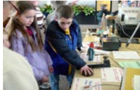
Sixty hands-on exhibits by professionals